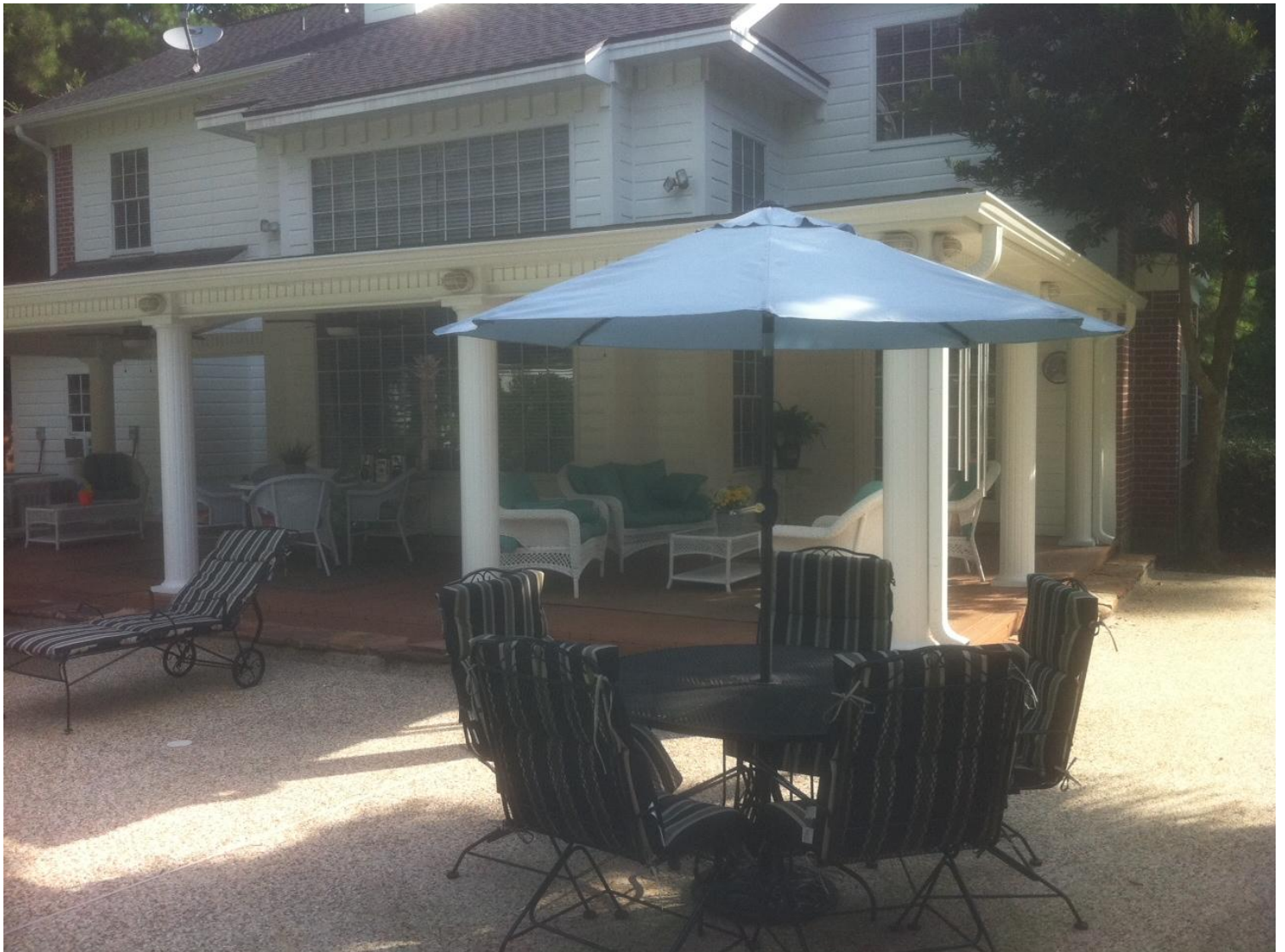
REAR VIEW 07/26/2016

If submitting more photographs than will fit on the preceding page, affix the additional photographs below. Identify all photographs with: date taken; "Front View" and "Rear View"; and, if required, "Right Side View" and "Left Side View." When applicable, photographs must show the foundation with representative examples of the flood openings or vents, as indicated in Section A8.