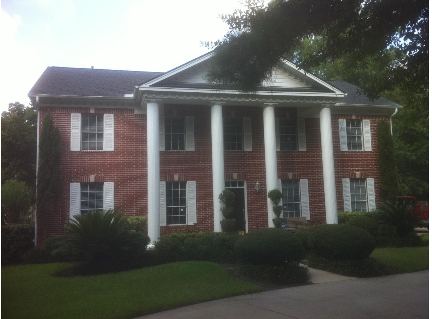
FRONT VIEW 07/26/2016

If using the Elevation Certificate to obtain NFIP flood insurance, affix at least 2 building photographs below according to the instructions for Item A6. Identify all photographs with date taken; "Front View" and "Rear View"; and, if required, "Right Side View" and "Left Side View." When applicable, photographs must show the foundation with representative examples of the flood openings or vents, as indicated in Section A8. If submitting more photographs than will fit on this page, use the Continuation Page.