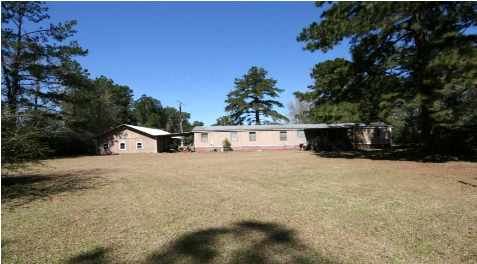
Mobile Home in Back of property