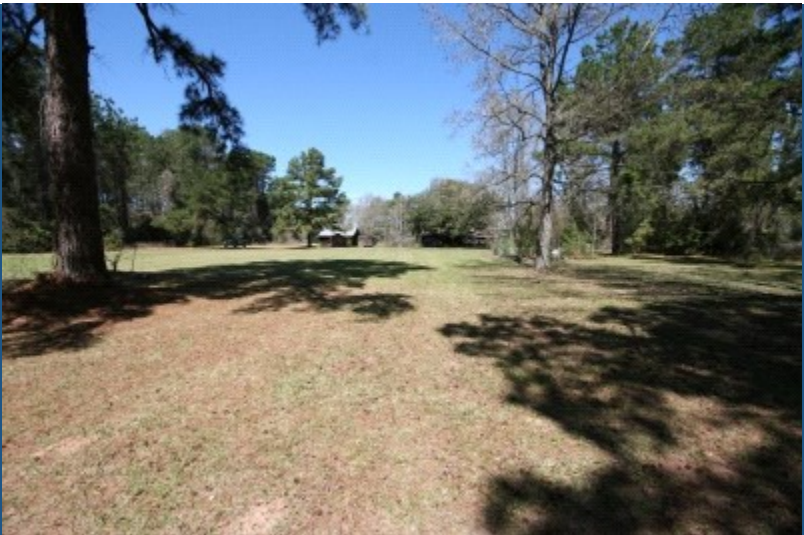
View from Back to Front

3.599 Acres, Unrestricted, Near FM 2978 Tomball, Texas, Tract 13A, ABST 50, Joseph Miller Survey per HCAD, HCAD ID #0410060060022,